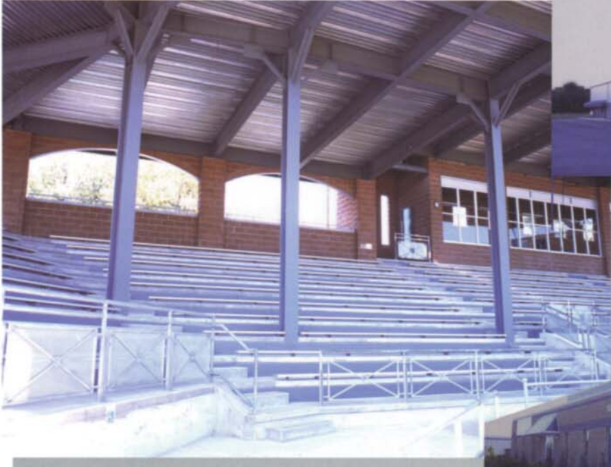
LABATT'S MEMORIAL GRANDSTAND LONDON, ONT.